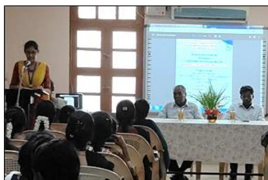
Skill Development Programme on “Developing Communication Skills in English” organised by Department of Botany on 09 th July 2024