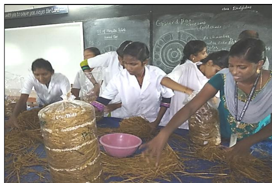
A one day workshop on “Edible Fungi culture - Methodology of Mushroom Cultivation” organised by the Department of Botany on 12 th September 2019