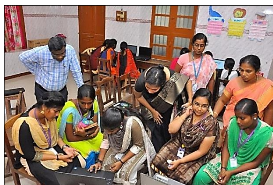
A one day workshop on “Virtual Dissection” organised by the Department of Zoology on 16 th March 2020