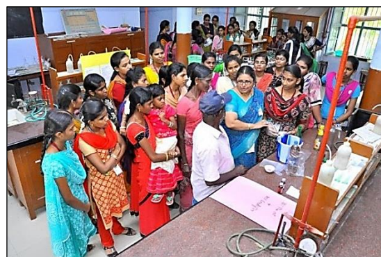
A one day workshop on “Chemist as Entrepreneur cum Hands on Training on House Hold Articles” organised by the Department of Chemistry on 18 th July 2019