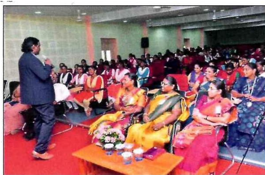
A one day workshop “Steering the Entrepreneurs: Strategies for Start-up Success” organised by Department of Botany in association with Economics on 16 th March 2024