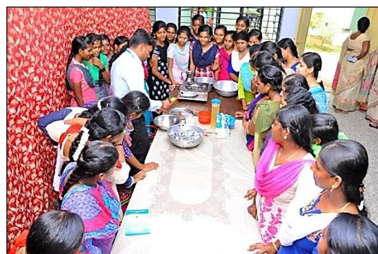
A one day workshop on “Value Added Fishery Products” organised by the Department of Zoology on 08 th September 2019