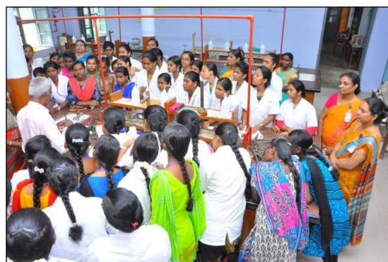
A one day workshop on “Microscale Techniques in Chemistry” organised by the Department of Chemistry on 24 th September 2019