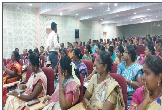
A one day workshop on “Elevate your research: author and editor insights for publishing in a reputed journal” organised Marian Star Centre and Marian Research Forum on 20 th August 2024