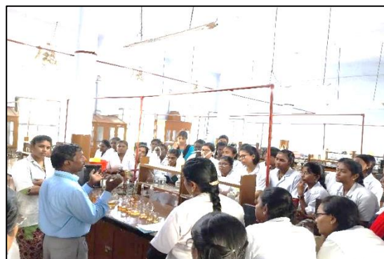
A one day workshop on “Green Synthesis of Metal Nanoparticles and Evaluation of Catalytic and Antioxidant properties” organised by the Department of Chemistry on 16 th February 2024