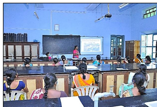
A one day workshop on “Laboratory Safety Measures for Supportive Staff” organised by Department of Chemistry on 27 th January 2021