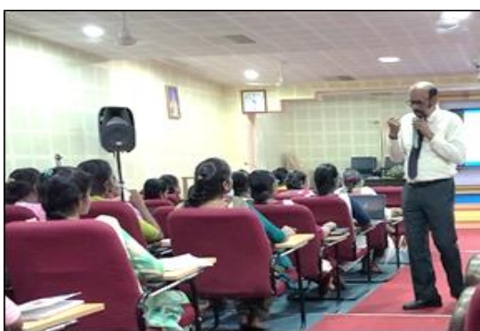
A three day National workshop cum Lecture on “Genetic Algorithm and Graph Theoretic Algorithm” (Hybrid Mode) organised by Department of Botany in association with Department of Mathematics from 17 th September 2024 to 19 th September 2024