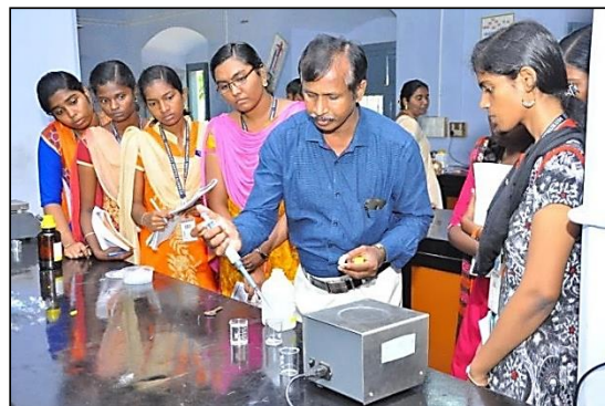
A one day workshop on “Bottom-Up Approaches” organised by the Department of Physics on 17 th December 2019