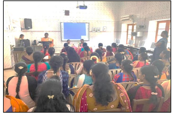
A one day workshop on “Experimental Techniques in Animal Physiology” organised by Department of Zoology on 03 rd September 2024