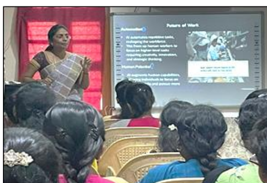
A one day workshop on “Intersection of Intangible Asset and Intellectual Property in Emerging Technologies” organised by Department of Botany in association with Department of Economics on 23 rd August 2024