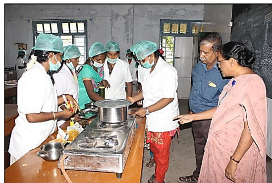
A one day lecture cum workshop on “Miracles of Seaweeds” organised by the Department of Botany on 9 th August 2019