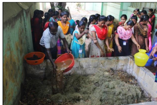
A one day workshop on “Biosolid Waste Management - Vermicompost Technology” organised by the Department of Botany on 10 th July 2019