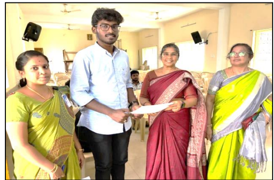
A one day workshop on “Harnessing AI and Cloud Computing for Breakthroughs in Biological Science” organised by Departments of Botany, Zoology and Computer Science on 09 th September 2024