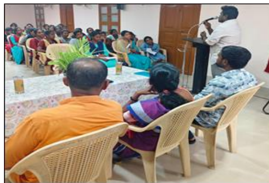
A one day workshop on “Career Oriented Course on TNPSC Mastery: Comprehensive Coaching for Success” organised by Department of Botany on 16 th July 2024