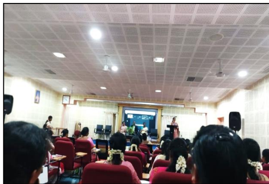
A two day National workshop on “IPR procedures and awareness” organised by Department of Botany from 13 th September 2024 to 14 th September 2024