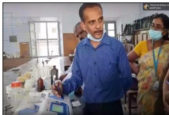
A one day workshop on “Clinical Laboratory Equipments” organised by Department of Chemistry and Zoology on 03 rd March 2021