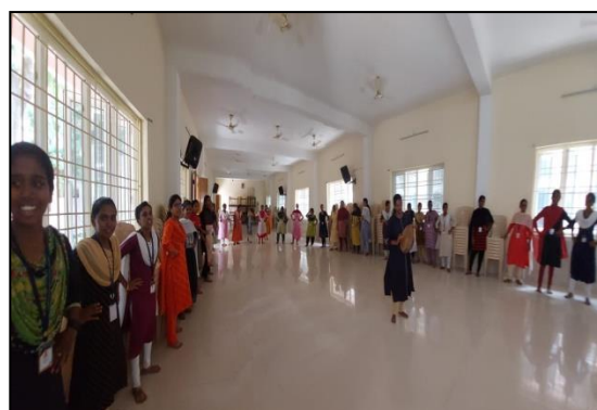
A two day workshop on “Nadaga kalaien vali Arivial Kattalum Karpithalum (நாடக கலையின் வழி அறிவியல் கற்றலும் கற்பித்தலும்)” organised by Department of Botany, Chemistry, Physics, Zoology and Tamil from 29 th to 30 th August 2024