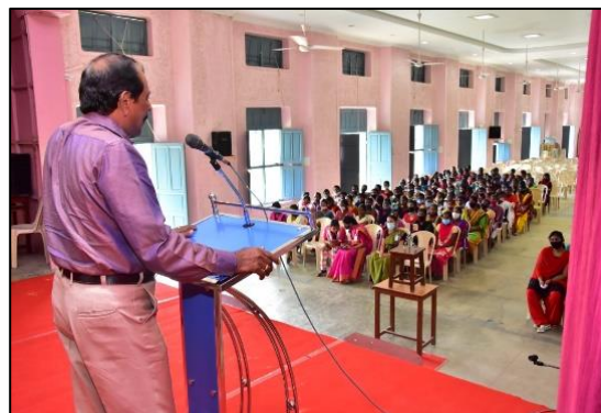
A one day workshop on “Urban and Peri-urban farming” organised by Department of Botany on 25 rd February 2021